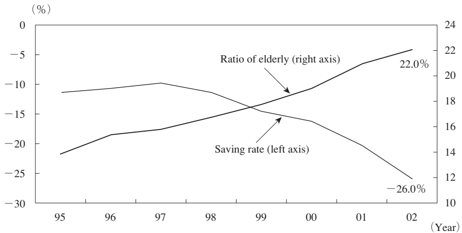
Figure 3 Transition of the ratio of the aged households without occupations and of their saving rate

Figures for Japan obtained from Annual Report on National Accounts (Economic and Social Research Institute, Cabinet Office, Government of Japan). Figures for other nations from OECD Economic Outlook No.73.